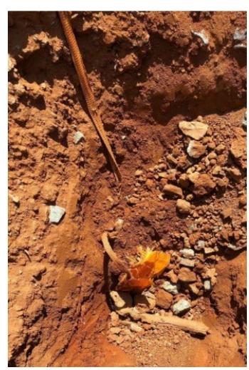
Figure 4: Signaltape Prevented Damage #2