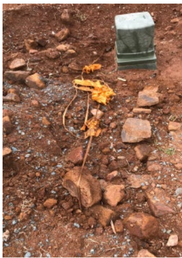
Figure 3: Signaltape Prevented Damage #1

Tings's early installations have increased the risk of conduit strikes; however, that risk can be significantly reduced by filling their gaps in protection. Ting will continue to monitor their New Belvedere subdivision in Charlottesville VA.