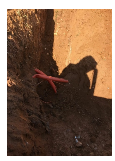
Figure 2: No Signaltape installed above Ting Conduit